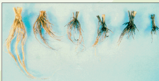
Figure 3: Increasing levels (left to right) of G. graminis infection of wheat roots. Notice the blackening of the crown and rotted root system in severe infections.

Initial indications of take-all in a crop are the appearance of indistinct patches of poor growth in the crop; these may be a few metres across up to significant areas of crop. Closer inspection of individual plants will indicate discolouration of the crown, roots and stem base. Blackening of the centre of the roots (stele) is symptomatic of an early take-all infection. Severely infected plants will have a blackened crown and stem base and be easy to pull from the soil with no attached root system (figure 3). Any remaining roots are brittle and break off with a "square end".