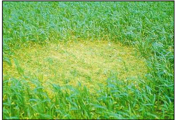
Figure 1: Rhizoctonia bare patch in a wheat crop (from MacNish, 2005).

The characteristic symptom of Rhizoctonia is clearly defined bare patches in the crop. The reason these patches are clearly defined relates to the susceptibility of young seedlings, and the placement of the fungus within the soil profile. Rhizoctonia solani tends to reside in the upper layers of soil but not in the surface and only infects seedlings through the root tip soon after germination. Older plants have a more developed root epidermis that does not allow the penetration of hyphae into the root. For this reason, once the crop is fully established, plants have either perished due to seedling infection or reasonably healthy. Some yield loss may be associated with plants on the margins of the bare patch.