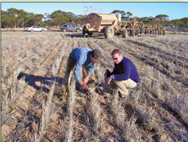
Figure 1: Inspecting stubble after sowing with a disc opener.

Historically, stubble has been burnt because it improves weed control and creates easier passage for seeding equipment. However, the practice of burning stubble has recently declined due to concerns about soil erosion and loss of soil organic matter. Instead of being burnt, stubble is increasingly being retained which has several advantages for soil fertility and productivity (figure 1).